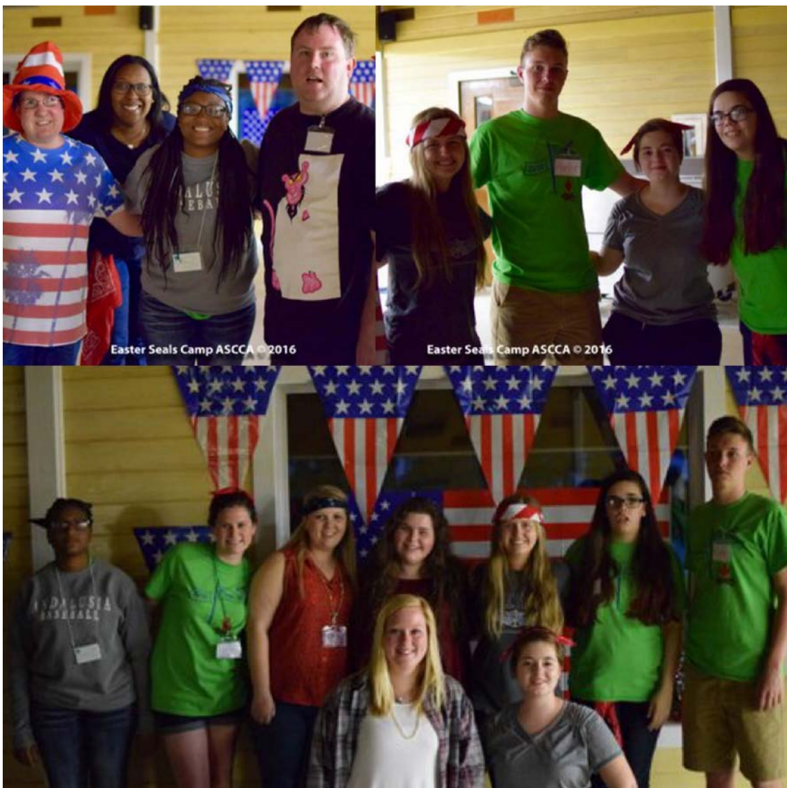
Anchors at the 2016 TBI Camp dance!

The money received from each club will be used to purchase items for the Mardi Gras parade, decorations and any additional items needed for the Pick-Me-Ups.