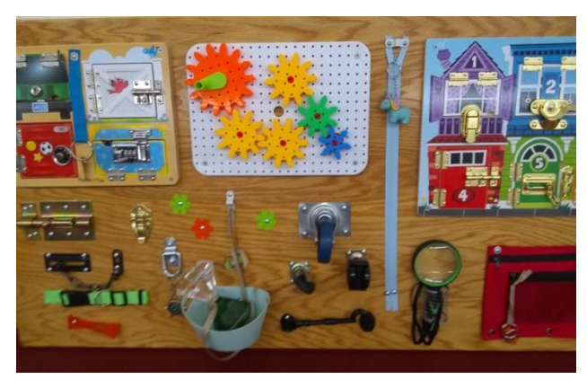
A close up of part of the project.

The creative team at work and showing final work.